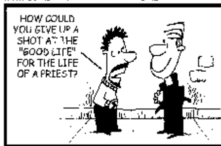
24th SUNDAY IN ORDINARY TIME