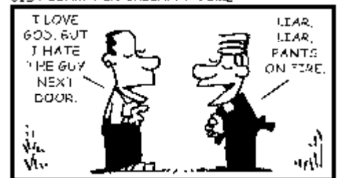
31ST SUNDAY IN ORDINARY TIME