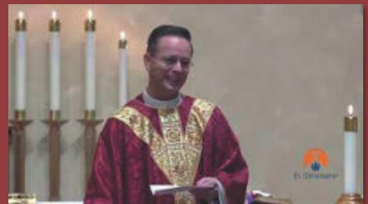
Red: Signifies God’s love, blood, and fire. It is used for Palm Sunday, Good Friday, Pentecost Sunday, the Sacrament of Confirmation. Red is also used for the Exaltation of the Holy Cross (Sept. 14).