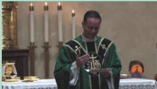
Green: Signifies hope, life, and anticipation. This color is used for Ordinary Time which is the time after the Baptism of the Lord and the time after Pentecost.

This being said, many of us may not remember what the liturgical Mass colors are and what they signify so I thought a brief review might be helpful.