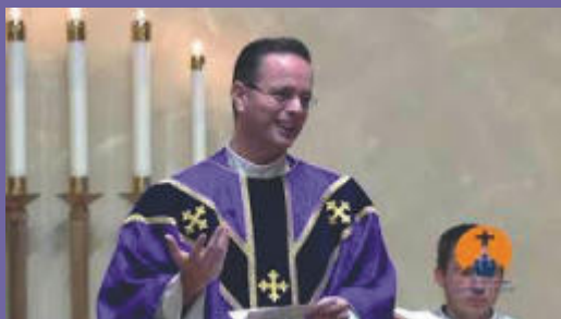
Violet Signifies penance, preparation, and sacrifice. This color is used for Advent and Lent.