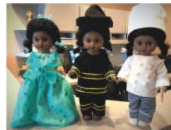
Dressed Dolls from 2019

While we're awaiting to see if our program will be in-person or virtual, we are in need of catechists, substitute catechists, and hall monitors for our program. Please contact Rob Leonardi at RobL@stephrem.org or 586-264-1230.