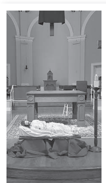
Holy Week at St. Mary Parish, Monroe: Palm Sunday and Good Friday photos