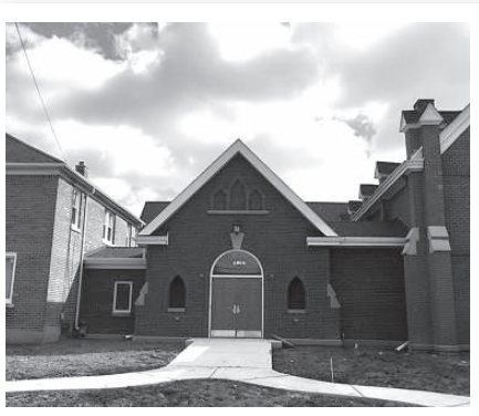
New addition and renovation at St. Mary, Our Lady of the Annunciation, Rockwood