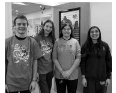
These St. Charles 8th grade leaders organized and planned the American Heart Association Service Project, Assembly, and Prize Distribution. Great job!