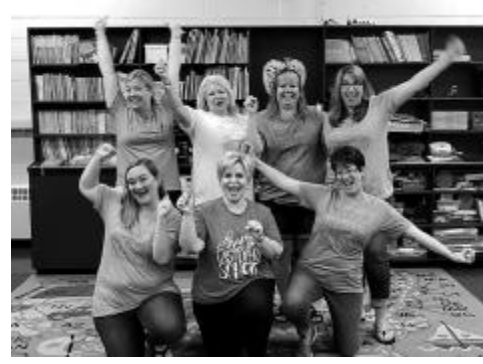
The teachers at St. Joseph School in Erie gearing up for a new school year.