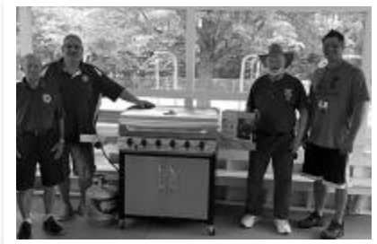
The Monroe Knights of Columbus, Council #1266, and the generosity of Lowe's donated a new grill to Holiday Camp.