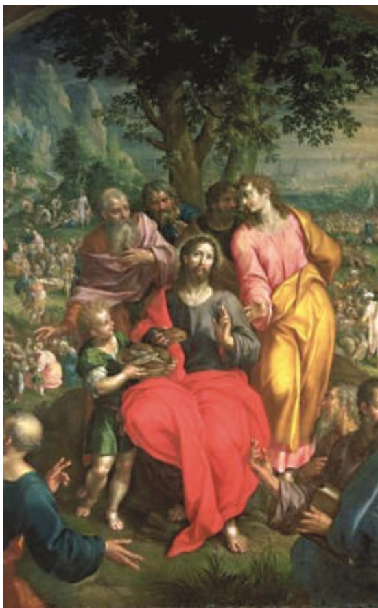
This painting by Hendrik de Clerck depicts the disciples' astonishment after Jesus delivered his teaching on the Eucharist at the Bread of Life Discourse.