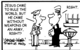
14TH SUNDAY IN ORDINARY TIME