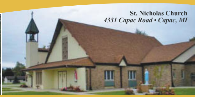
Through the Intercession of St. Nicholas to the Sacred Heart of Jesus