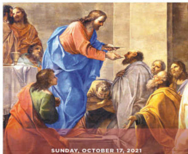
SUNDAY, OCTOBER 17, 2021

You may place the request sheet into the collection basket at weekend Masses, return it to the office, or you may also call the office with your request.