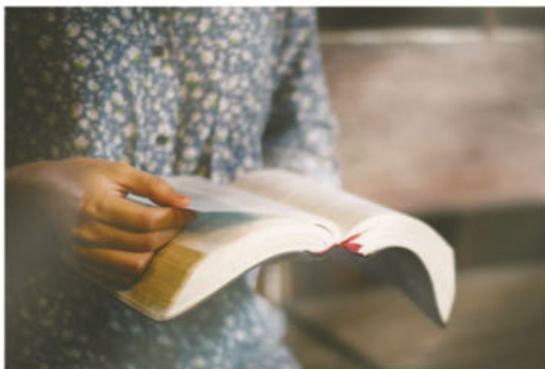
Excerpts from the Lectionary for Mass ©2001, 1998, 1970 CCD. The English translation of Psalm Responses from Lectionary for Mass © 1969, 1981, 1997, International Commission on English in the Liturgy Corporation. All rights reserved.