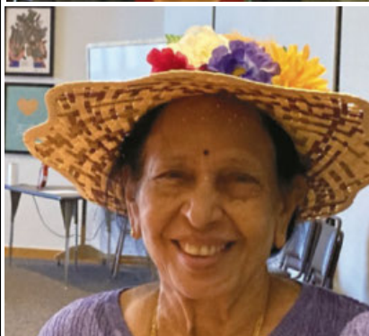
JCS clients wearing hats that they made years ago in the program to kick off the spring season.

ISRAEL CELEBRATES 74 YEARS OF INDEPENDENCE