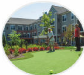
Events & Activities