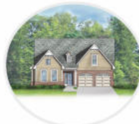
Independent Living Cottages

(248) 621-3100 | 101 E Scripps Rd | Orion Charter Township, MI 48360