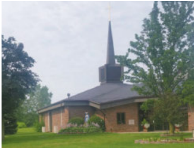
St. Cornelius 3834 N. Mill St. Dryden, MI 48428 (810)796-2926 fmsaints.com