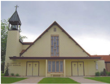
St. Nicholas 4331 Capac Rd. Capac, MI 48014 (810)395-7572 imlaycitysacredheart.org