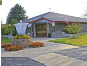
Sacred Heart 700 Maple Vista Imlay City, MI 48444 (810)724-1135 imlaycitysacredheart.org