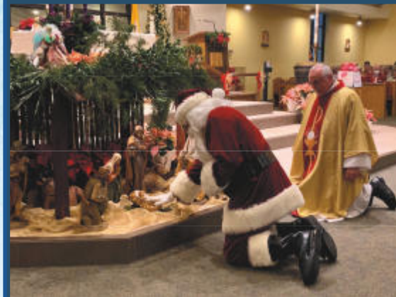
Santa reverencing Jesus.