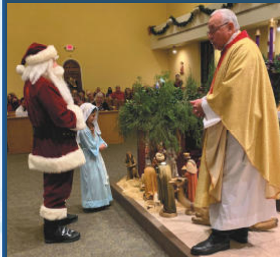
After mass singing Happy Birthday to Jesus.