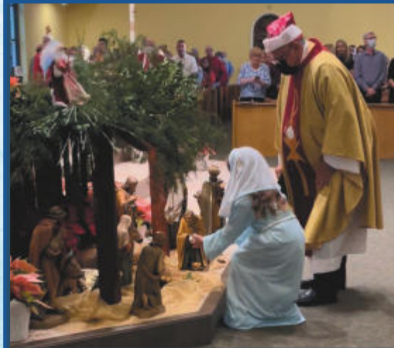
Mary putting Jesus in the manger.

Amount needed Weekly for Operating Expenses: $9,765.00