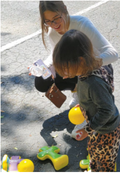
Having "egg-stra" special fun at the STA Easter Egg Hunt