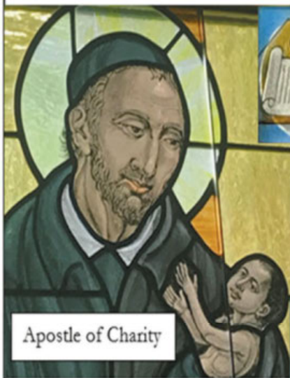
Apostle of Charity