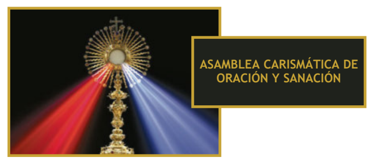
Renovación Carismática Católica de Carolina del Sur Viernes de 7:00 p.m. a 9:15 p.m.

A los discípulos en Pentecostés se les dio la gracia de hablar en lenguas de muchas naciones. Cuando nos relacionamos con aquellos que no creen, que no están de acuerdo con nosotros, ¿estamos hablando el idioma correcto? Tenemos que usar las palabras que pueden entender, no solo las palabras que queremos decir. ©LP©