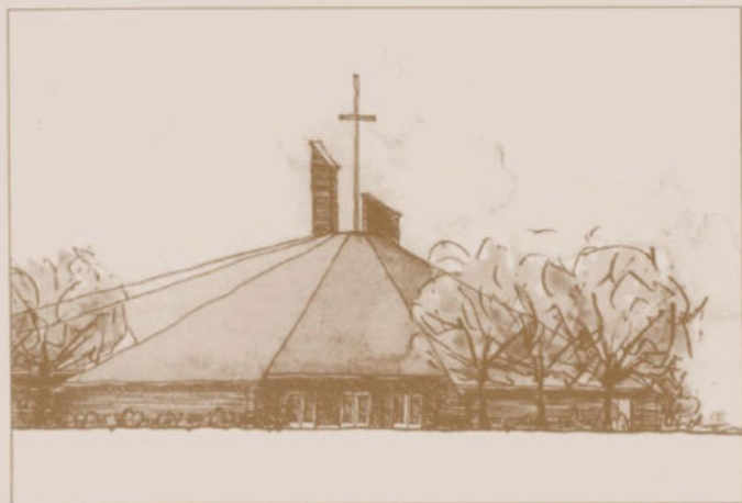
ST. MARY MAGDALENE CHURCH SIMPSONVILLE, SOUTH CAROLINA