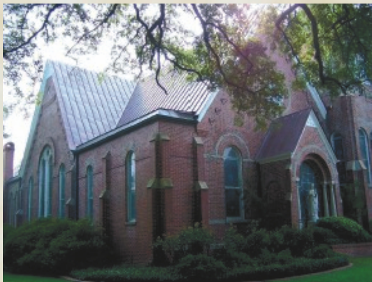
A Church of the Diocese of Charleston

Office Hours: Monday – Thursday 9:00 AM to 5:00 PM Friday 9:00 AM to 1:00 PM Phone: 843-546-7416 Fax: 843-546-7003