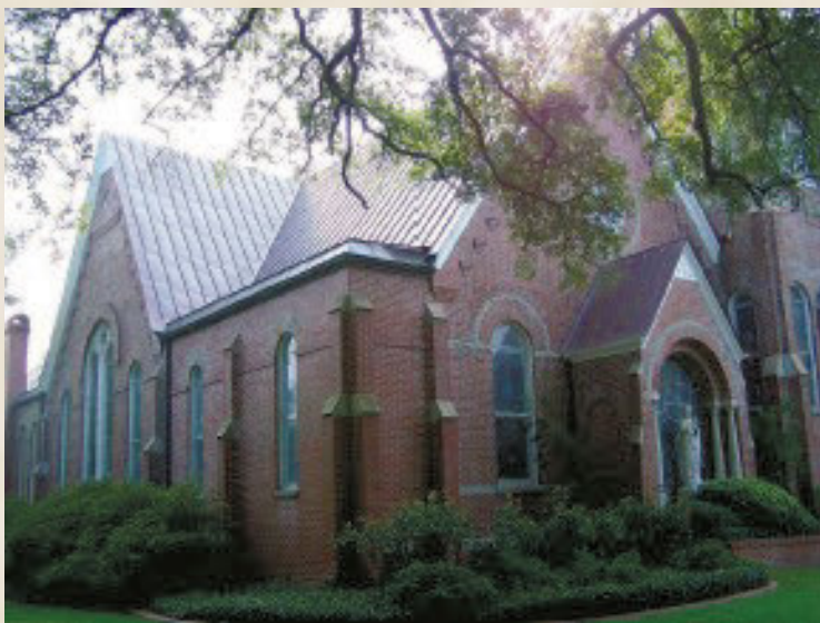
A Church of the Diocese of Charleston

Office Hours: Monday – Thursday 9:00 AM to 5:00 PM Friday 9:00 AM to 1:00 PM Phone: 843-546-7416 Fax: 843-546-7003