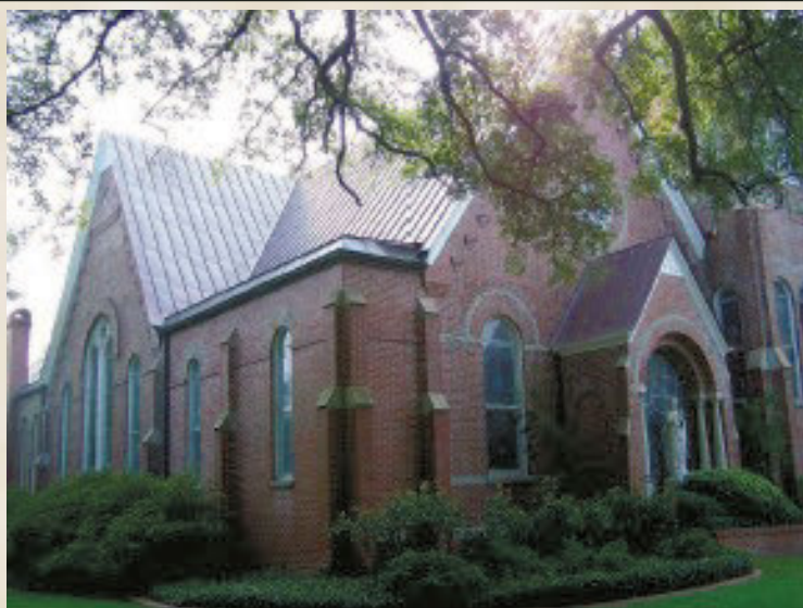
A Church of the Diocese of Charleston

Office Hours: Monday – Thursday 9:00 AM to 5:00 PM Friday 9:00 AM to 1:00 PM Phone: 843-546-7416 Fax: 843-546-7003