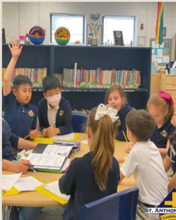
Small groups include a mix of students from different grades to help challenge and broaden their horizons.