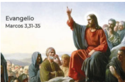
Evangelio Marcos 3,31-35