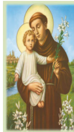
SAN ANTONIO DE PADUA (Presbítero y Doctor 1231)

"San Antonio, glorioso siervo de Dios, famoso por tus méritos y potentes milagros, danos tu ayuda en las pruebas e ilumina nuestra mente en la búsqueda de hacer la voluntad de Dios". Amén.