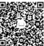
Purchase Workbook Here