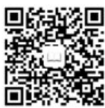
Order Haily Holy Queen Book