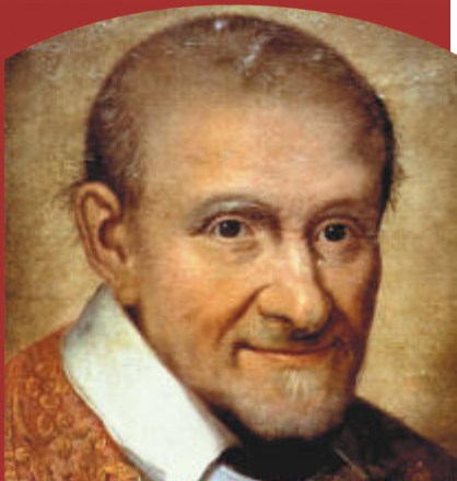
St. Vincent De Paul (1581–1660)