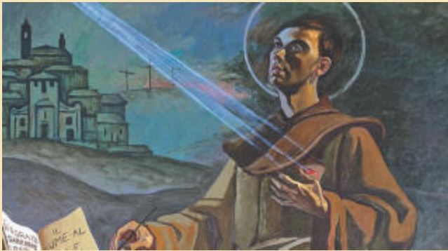
October 19, 1613 – January 6, 1670