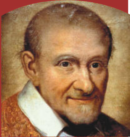
St. Vincent De Paul (1581–1660)