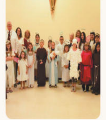
Christmas Nativity Drama