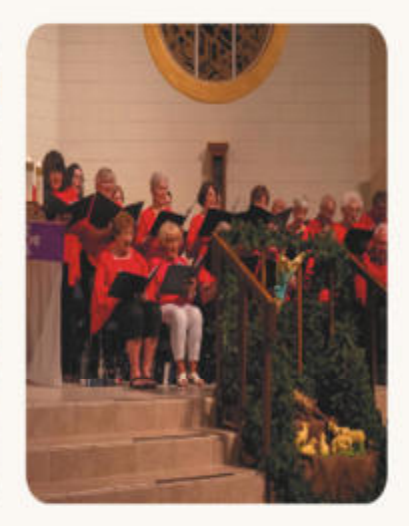
Lessons & Carols