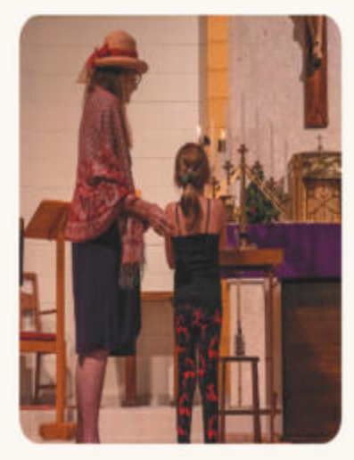
Lessons & Carols