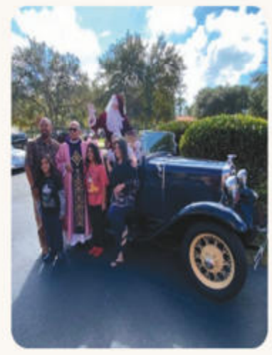
Knights of Columbus Pancake Breakfast