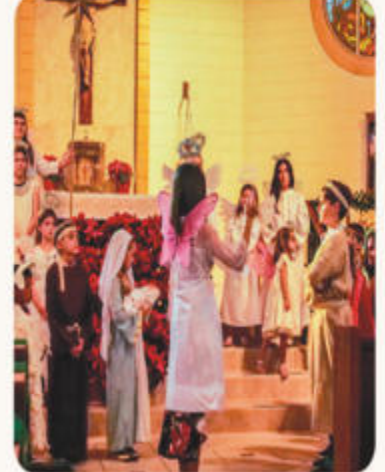
Christmas Nativity Drama