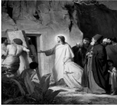
"Lazarus, come out!"