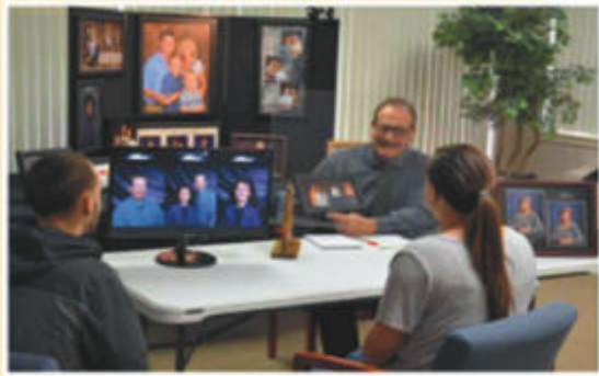
New Safety Glass at Viewing Station

Celebrating Faith. Connecting Families. Sharing hope. Join us for this "Connections Event" and be part of what God is doing at St. Isabel Parish!