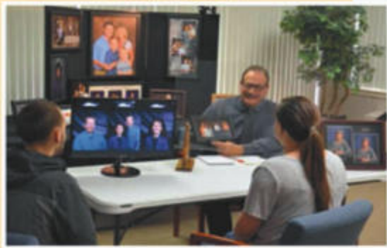
New Safety Glass at Viewing Station

Join us for this "Family Connections Event" and be part of what God is doing right here at your church!