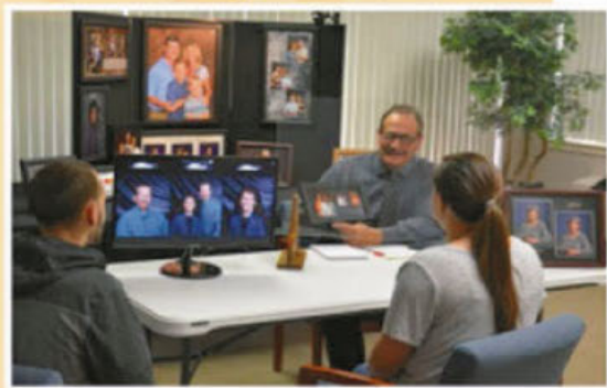
New Safety Glass at Viewing Station

Join us for this "Family Connections Event" and be part of what God is doing right here at your church!