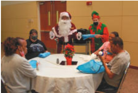
Santa and his elf giving presents.