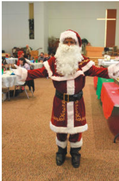
Our very own Santa!