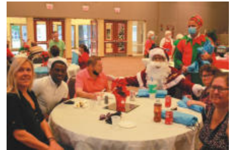
Santa and another elf giving presents.