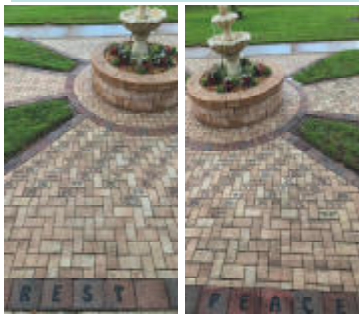
Thank you to the Knights of Columbus who sponsored the Memorial Garden brick pavers. Thank you for your generosity and restoring our Memorial Garden.