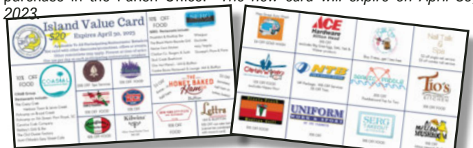
Front of card

The NEW St. Francis School Island Value Card is available! Present your card at area restaurants and retailers to save, all the while supporting our school! Cards are $20 each and cards are available for purchase in the Parish Office. The new card will expire on April 30, 2023.