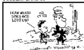
THE SUNDAY OF EASTER