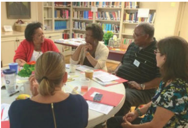
Annual Small Faith Community Leaders' Retreat at Ignatius House