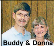
Buddy & Donna

New & Used Hot Tubs See them all on our web site: www.BuddyBrill.com email: buddy@buddybrill.com 1-800-223-1240