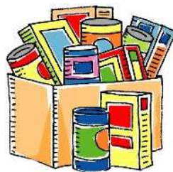
Table of Plenty

After Masses ..... Scrip Sales (Marian Room) 11:45am ..... Confession (SSPP) 2:30pm ..... Bereavement Haven (SB social hall)