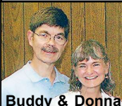
Buddy & Donna

New & Used Hot Tubs See them all on our web site: www.BuddyBrill.com email: buddy@buddybrill.com 1-800-223-1240