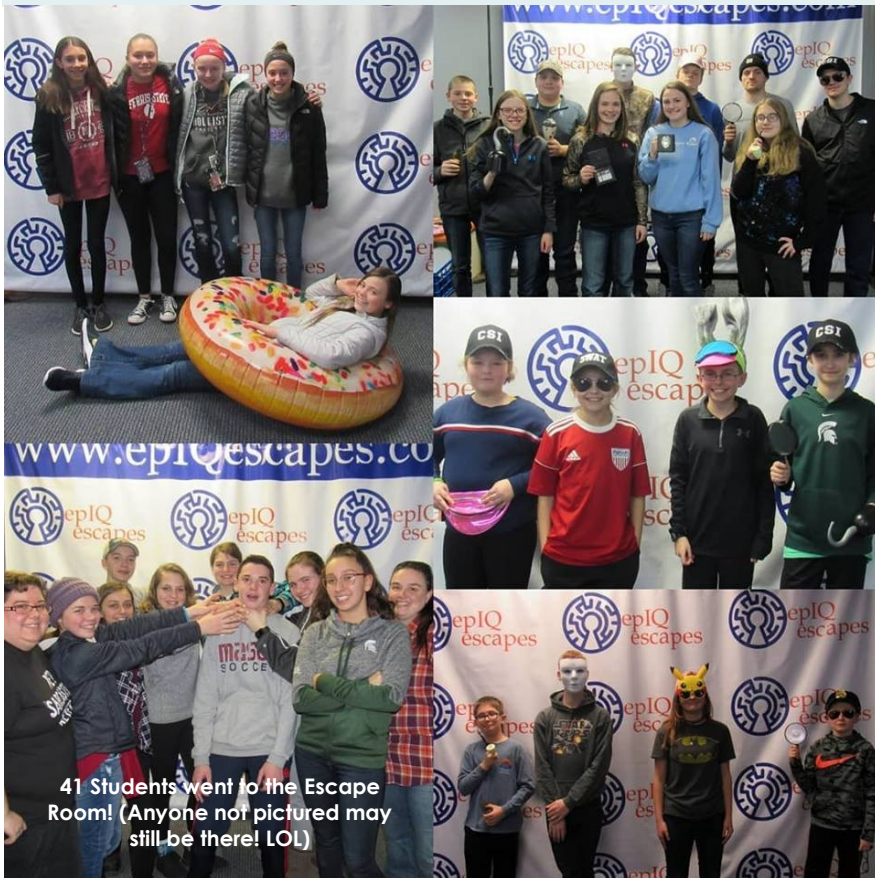
41 Students went to the Escape Room! (Anyone not pictured may still be there! LOL)

9 th —Parish Assembly! 10 th —ROCK & Encounter 10:00-11:30am (CC) ROCK 5-7pm (SJ) 12 th —ENCOUNTER 6-8pm (Mason) 17 th —Encounter 9:30-11:15am (CC) Ski Trip! 19 th —ENCOUNTER 6-8pm (Mason) 24 th —Encounter 9:30-11:15am (CC) Laser Tag & Trampolines 26 th —Encounter 6—8 pm (Mason)