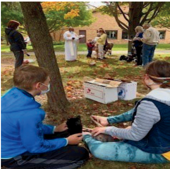
Blessing of the Pets last Sunday! Thanks to all who joined us!