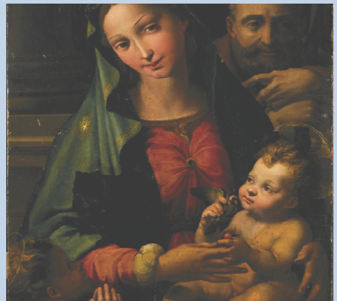
Pierino, MET Museum

POPE FRANCIS' VISION IS A VISION OF JOY-FILLED LOVE. LET'S SHARE IT!