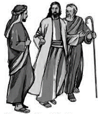
On the Road to Emmaus

755-5634 or www.shelcocath.pvt.k12.ia.us