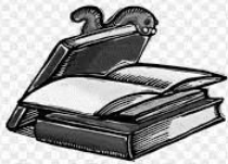
Used Book Sale

The Scripture Study on the Book of Acts will resume 7pm on Tues., Sept. 7 thru Tues., Oct. 26. at Panama Parish Hall. We will review Session 2, p. 11-15 in your book. Please come ready to discuss Session 3 pages 19 -24. Questions, call Jann Reinig at 744-3209.