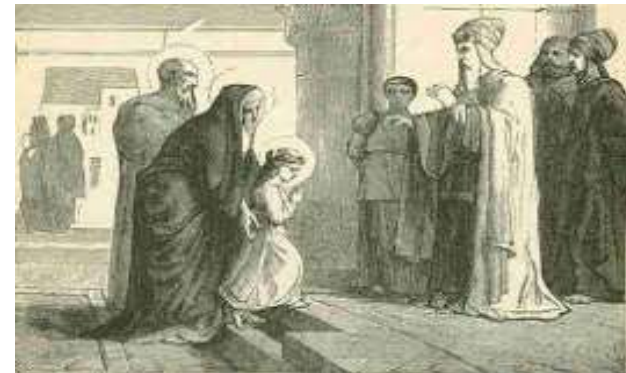
THE PRESENTATION OF THE BLESSED VIRGIN MARY 21st of November

CRISIS PREGNANCY CENTER 1622 Pine Ave. Niagara Falls, NY call 716-298-8600, www.summitlifecenter.org