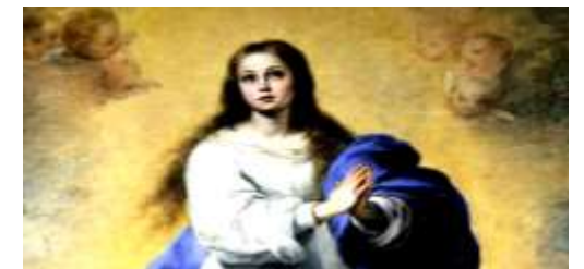
Feast of the Immaculate Conception Celebrated on Monday, 12/9/20

Conception with the Feast of St. Juan Diego