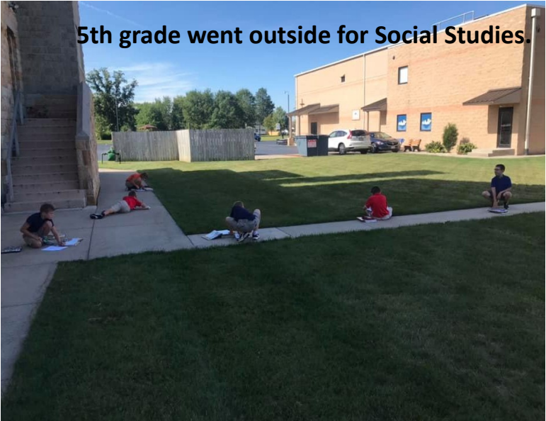
5th grade went outside for Social Studies.