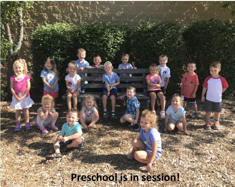
Preschool is in session!

"Jesus Christ is the reason St. Anthony of Padua School exists. He guides our staff, students, and parents to work collaboratively to strengthen the quality of our educational and spiritual community. He is the unseen but ever present teacher in our classes. He is the model of our faculty and the inspiration for our students to live Gospel values." ~ St. Anthony Mission Statement ~