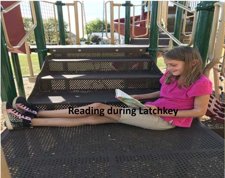
Reading during Latchkey