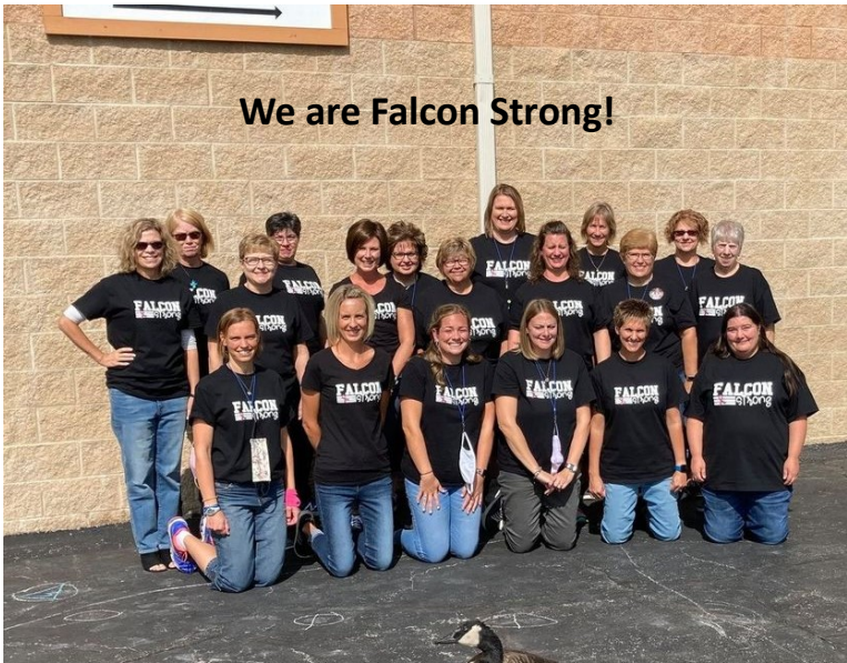
We are Falcon Strong!