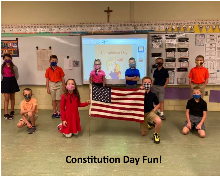
Constitution Day Fun!

"Jesus Christ is the reason St. Anthony of Padua School exists. He guides our staff, students, and parents to work collaboratively to strengthen the quality of our educational and spiritual community. He is the unseen but ever present teacher in our classes. He is the model of our faculty and the inspiration for our students to live Gospel values." ~ St. Anthony Mission Statement ~