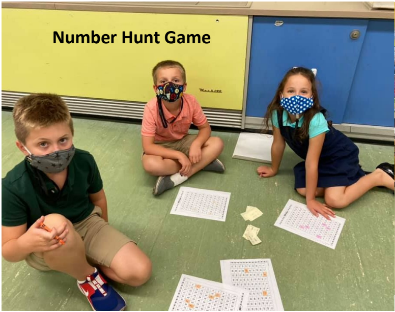
Number Hunt Game